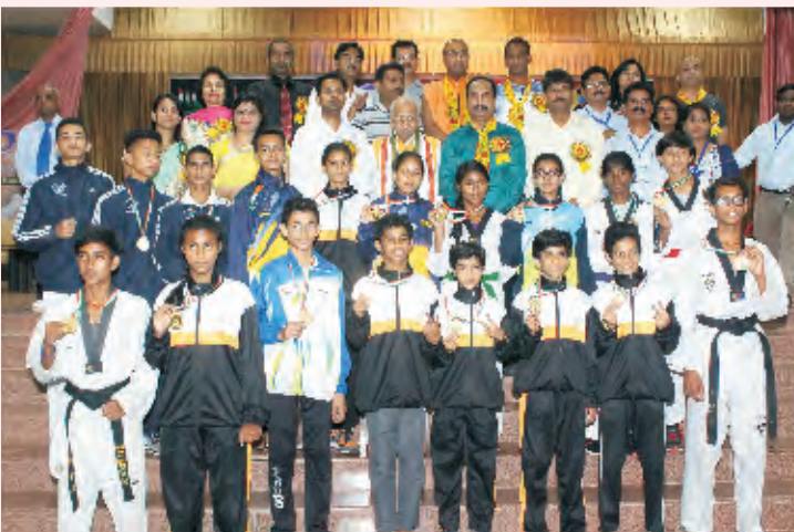
The school hosted 3rd National Cadet Taekwondo Championship 2017