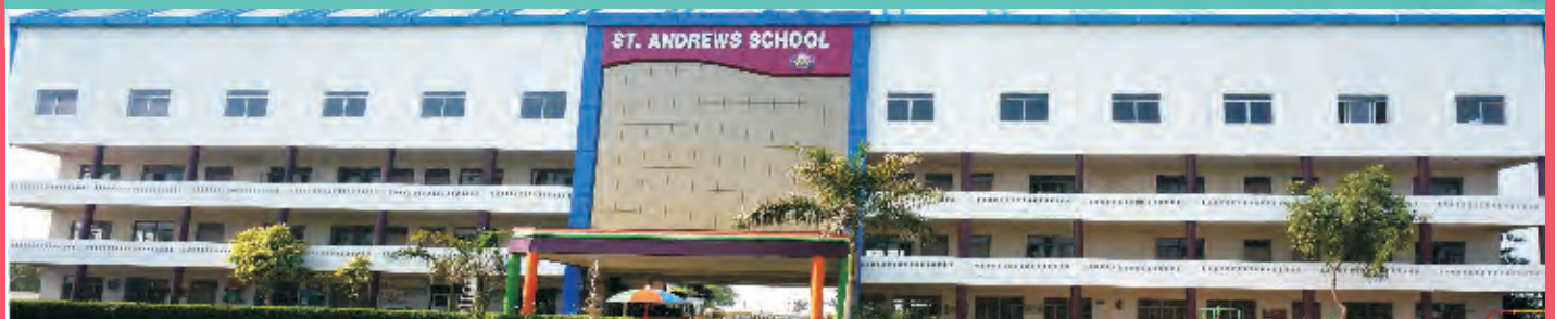
St. Andrews School, Shamshabad Road, Agra M.: 9720005920

Website : www.standrewsagra.com E-mail : andrews1717@gmail.com