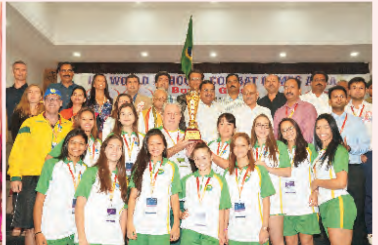
The school conducted ISF International Games which was participated by 300 participants from all over the world