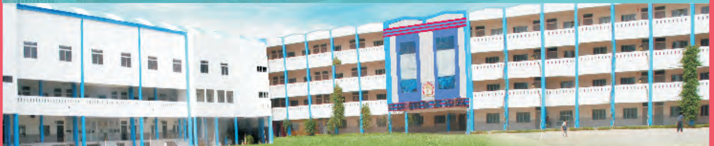
St. Andrews Public School, Kamla Nagar, Agra M.: 9720005927