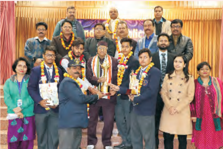
Out of 6 Lakh participants from all over the nation our students won 2nd position in National G.K. Quiz Competition- Bharat Ko Jano