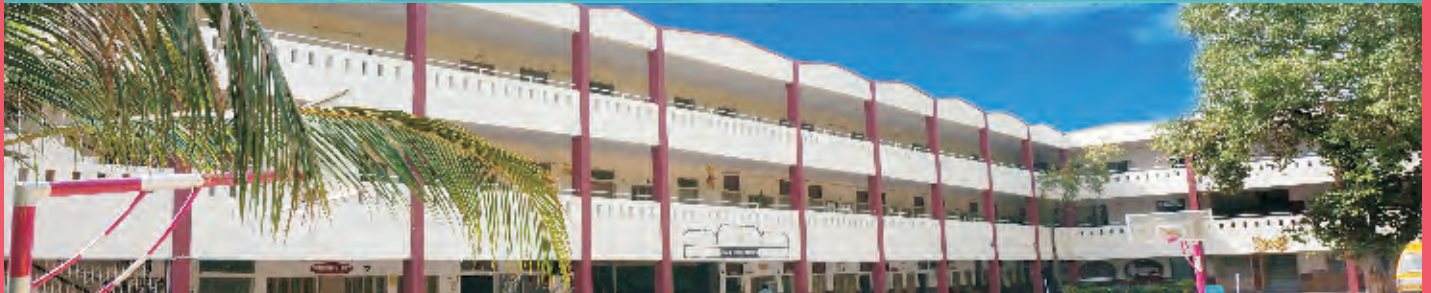
C.F. Andrews School, Balkeshwar Road, Agra M.: 9720005923